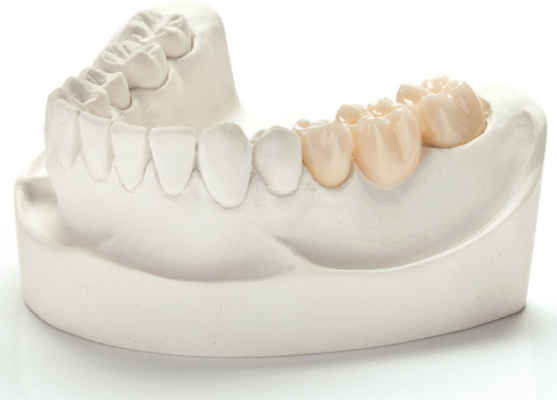
*Digitally scanned cases

*Turnaround times are measured in business days, beginning when the case is received in lab. 3-day TAT is $50 extra per unit, must specify rush case in notes and contact Customer Care at (877) 337-7800.