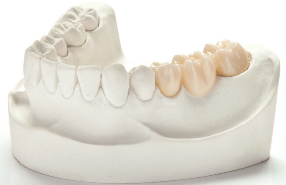
*Digitally scanned cases

*Turnaround times are measured in business days, beginning when the case is received in lab. 3-day TAT is $50 extra per unit, must specify rush case in notes and contact your Heartland dedication team.